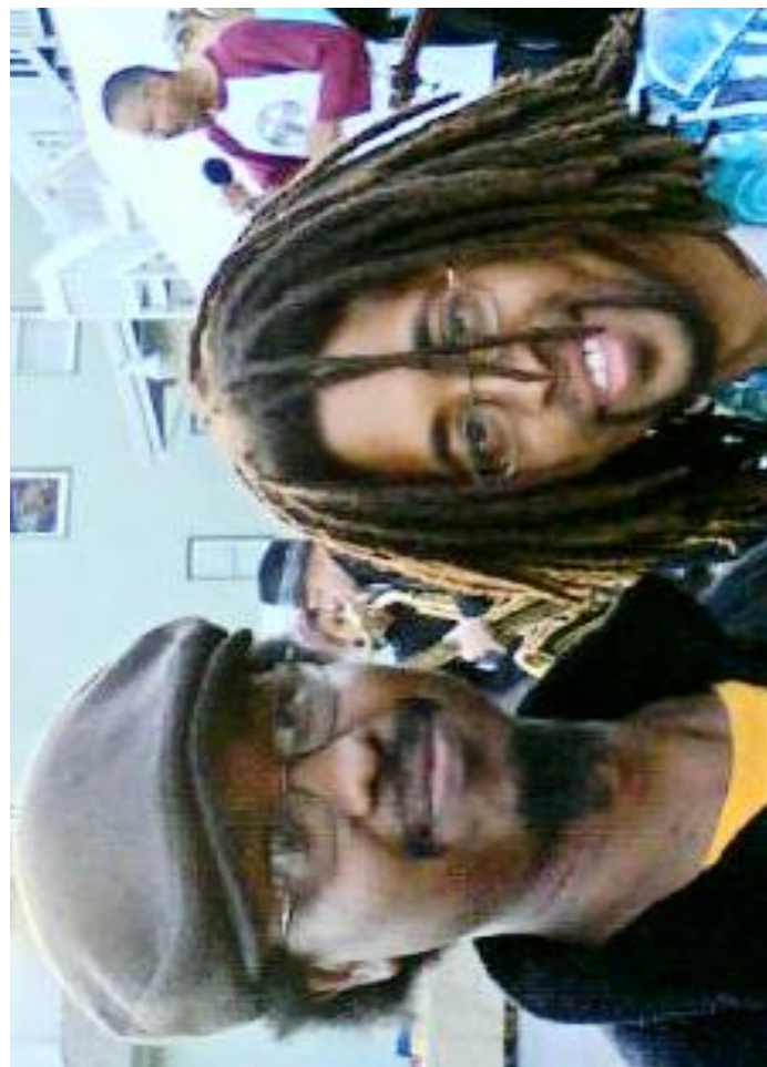
A PUBLICATION OF THE SACRAMENTO POETRY CENTER